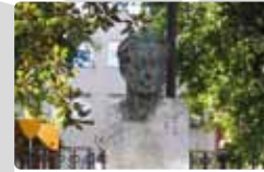
17. MONUMENT TO GABRIEL MIRÓ