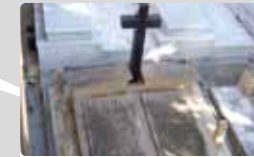
14. RAMÓN SIJÉ BURIAL SITE (NITRO PADRE JESÚS CEMETARY)