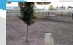
12. CIPRÉS MÁXIMO (PARK OF LAS ESPENETAS)