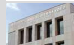
11. CASA DEL PASO