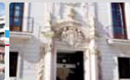
7. RAMÓN SIJÉ'S SQUARE