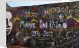
13. SAN ISIDRO NEIGHBOURHOOD WALL PAINTINGS