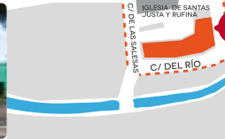
8. PORTILLO'S PALACE