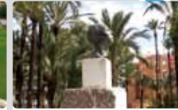
15. MONUMENT TO MIGUEL HERNÁNDEZ (ENTRANCE Bº SAN ANTÓN)