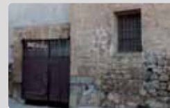
3. SANTO DOMINGO SCHOOL (AVE MARÍA SCHOOLS)