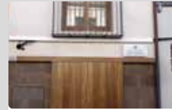
1. MIGUEL HERNÁNDEZ'S BIRTH PLACE