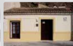
4. MIGUEL HERNÁNDEZ HOUSE MUSEUM