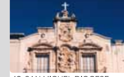
10. SAN MIGUEL DIOCESE SEMINARY