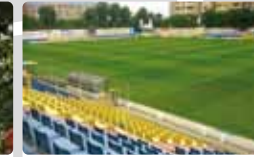
16. "LOS ARCOS" FOOTBALL GROUND