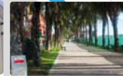
9. RAMÓN SIJÉ'S HOUSE