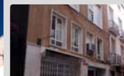
17. MONUMENT TO GABRIEL MIRÓ