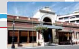
6. CASINO ORCELITANO